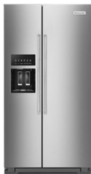
ALSO AVAILABLE / STEP UP KRSF705H

Be sure to tune into your customers' shopping priorities to bundle products across categories