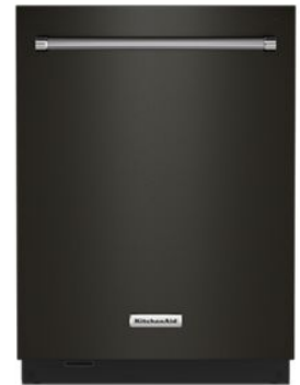
SUITE MATCH DISHWASHER KDTM604K