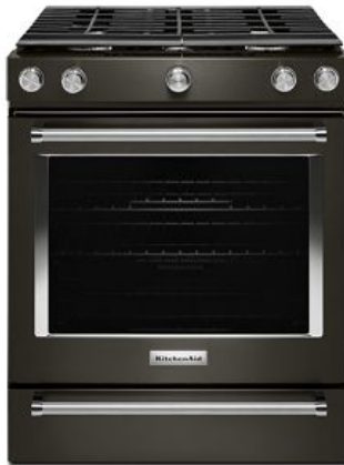
SUITE MATCH COOKING RANGE / WALL OVEN KSGG700E