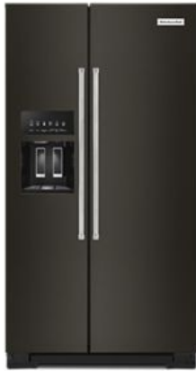
ALSO AVAILABLE / STEP UP KRSF705H

Be sure to tune into your customers' shopping priorities to bundle products across categories