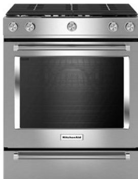
SUITE MATCH COOKING RANGE / WALL OVEN KSGG700E