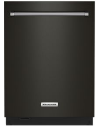
SUITE MATCH DISHWASHER KDTM604K