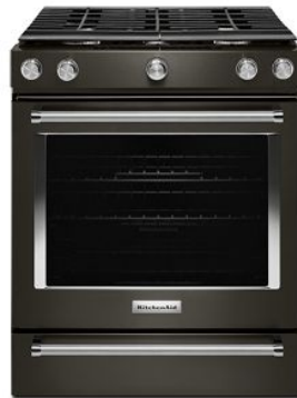
SUITE MATCH COOKING RANGE / WALL OVEN KSGG700E