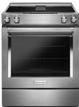
ALSO AVAILABLE / STEP UP KSEG950E

Be sure to tune into your customers' shopping priorities to bundle products across categories