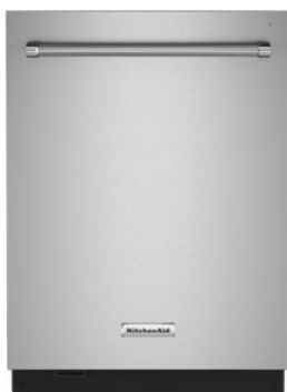
SUITE MATCH DISHWASHER KDTM704K