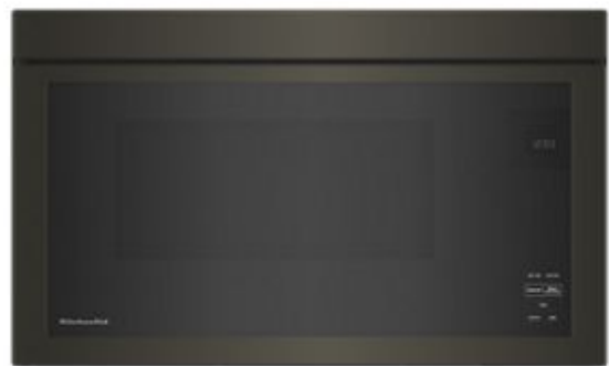
SUITE MATCH COOKING COOKTOP / MICROWAVE / VENTILATION KMMF330P