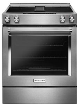
ALSO AVAILABLE / STEP UP KSEG950E

Be sure to tune into your customers' shopping priorities to bundle products across categories