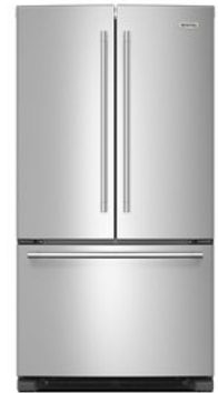
SUITE MATCH REFRIGERATOR MRFF4236R