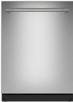
ALSO AVAILABLE / STEP UP MDTS7024S

Be sure to tune into your customers' shopping priorities to bundle products across categories