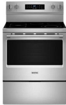
SUITE MATCH COOKING RANGE / WALL OVEN MFES6030R