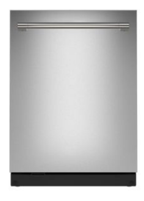
ALSO AVAILABLE / STEP UP MDTS7024S

Be sure to tune into your customers' shopping priorities to bundle products across categories