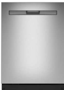
ALSO AVAILABLE / STEP UP MDP57024S

Be sure to tune into your customers' shopping priorities to bundle products across categories