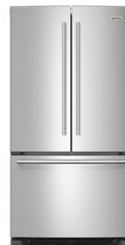
SUITE MATCH REFRIGERATOR MRFF4236R