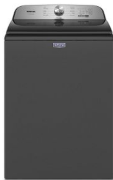
LAUNDRY / PAIR WITH MVW6500M

Be sure to tune into your customers' shopping priorities to bundle products across categories