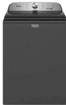
LAUNDRY / PAIR WITH MVW6500M

Be sure to tune into your customers' shopping priorities to bundle products across categories