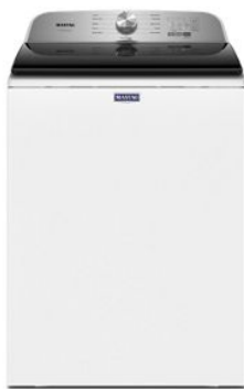
LAUNDRY / PAIR WITH MVW6500M

Be sure to tune into your customers' shopping priorities to bundle products across categories