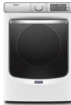
LAUNDRY / PAIR WITH MED8630H