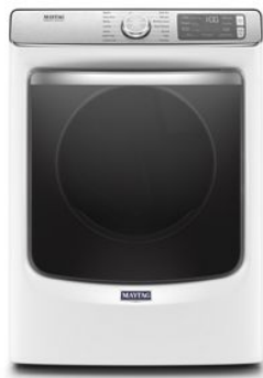
ALSO AVAILABLE / STEP UP MED8630H

Be sure to tune into your customers' shopping priorities to bundle products across categories