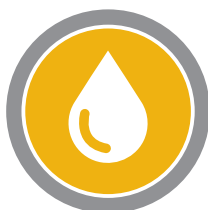
Automatic water level adjustments