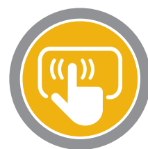
Drying cycles for the care of all fabrics