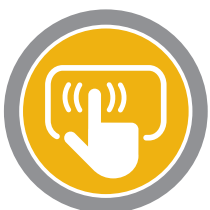
Specialized wash cycles

Washers often have a variety of special features to make the washing process simpler, more effective, and tailored to each unique load's needs. While features vary by model, some of the available features include: