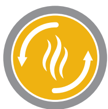
Wrinkle prevention options

Like washers, dryers often come with specialized features to provide the best fabric care possible. Features vary by unit, but may include: