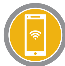
Smartphone app compatibility