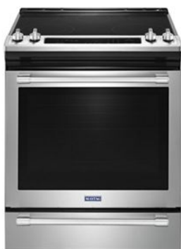
ALSO AVAILABLE / STEP UP MES8800F

Be sure to tune into your customers' shopping priorities to bundle products across categories