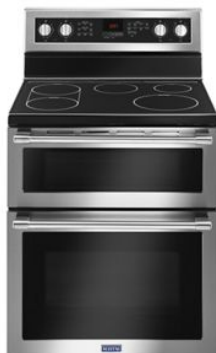
SUITE MATCH COOKING RANGE / WALL OVEN MET8800F