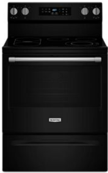
ALSO AVAILABLE / STEP UP MFES6030R

Be sure to tune into your customers' shopping priorities to bundle products across categories