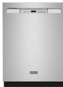
SUITE MATCH DISHWASHER MDB4949SK