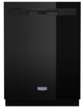
SUITE MATCH DISHWASHER MDB4949SK