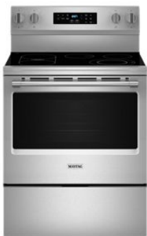
ALSO AVAILABLE / STEP UP MFES6030R

Be sure to tune into your customers' shopping priorities to bundle products across categories