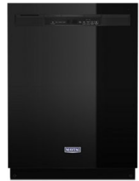
SUITE MATCH DISHWASHER MDB4949SK