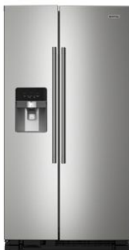
SUITE MATCH COOKING RANGE / WALL OVEN MRSF4036P