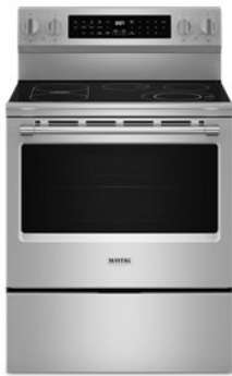
ALSO AVAILABLE / STEP UP MFES8030R

Be sure to tune into your customers' shopping priorities to bundle products across categories