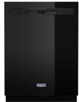
SUITE MATCH DISHWASHER MDB4949SK