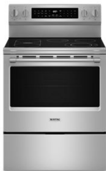
ALSO AVAILABLE / STEP UP MFES8030R

Be sure to tune into your customers' shopping priorities to bundle products across categories