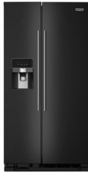
SUITE MATCH COOKING RANGE / WALL OVEN MRSF4036P