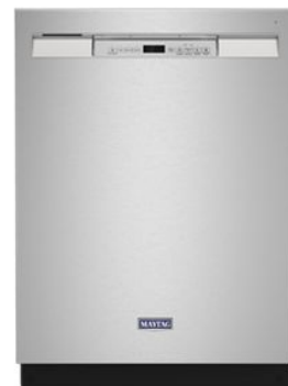
SUITE MATCH DISHWASHER MDB4949SK