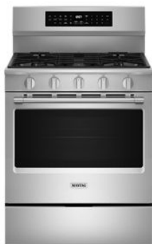
ALSO AVAILABLE / STEP UP MFGS8030R

Be sure to tune into your customers' shopping priorities to bundle products across categories