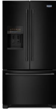
SUITE MATCH COOKING RANGE / WALL OVEN MFI2570FE