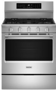
ALSO AVAILABLE / STEP UP MFGS8030R

Be sure to tune into your customers' shopping priorities to bundle products across categories