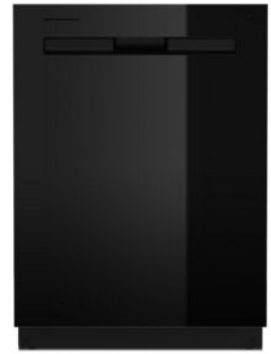
SUITE MATCH DISHWASHER MDB8959SK