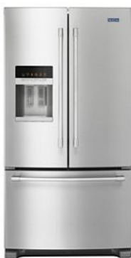
SUITE MATCH REFRIGERATOR MFI2570FE