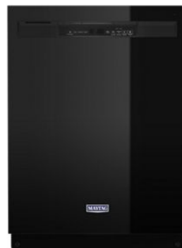
SUITE MATCH DISHWASHER MDB4949S