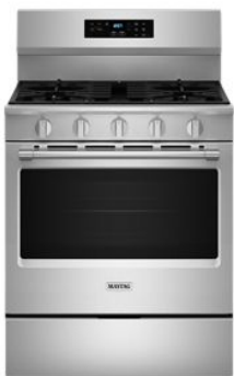
ALSO AVAILABLE / STEP UP MFGS6030R

Be sure to tune into your customers' shopping priorities to bundle products across categories