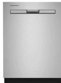
SUITE MATCH DISHWASHER MDB8959SK