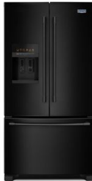
SUITE MATCH COOKING RANGE / WALL OVEN MFI2570FE