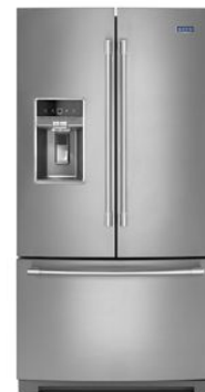
SUITE MATCH REFRIGERATOR MFT2772H