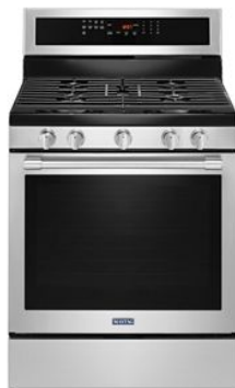
SUITE MATCH COOKING RANGE / WALL OVEN MGR8800F