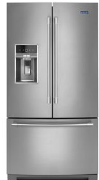
SUITE MATCH REFRIGERATOR MFT2772H