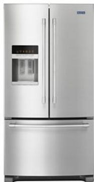
ALSO AVAILABLE / STEP UP MFI2570FE

Be sure to tune into your customers' shopping priorities to bundle products across categories