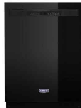
SUITE MATCH DISHWASHER MDB4949S