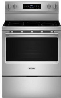
SUITE MATCH COOKING RANGE / WALL OVEN MFES6030R