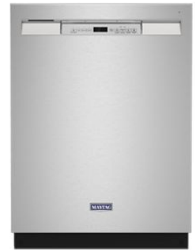
SUITE MATCH DISHWASHER MDB4949SK