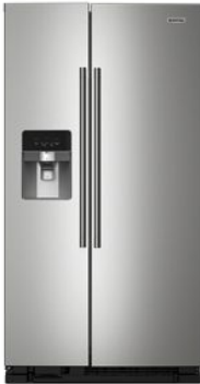
ALSO AVAILABLE / STEP UP MRSF4036P

Be sure to tune into your customers' shopping priorities to bundle products across categories