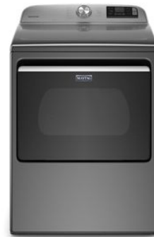
LAUNDRY / PAIR WITH MED6230