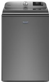
ALSO AVAILABLE / STEP UP MVW7230H

Be sure to tune into your customers' shopping priorities to bundle products across categories