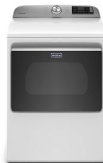
LAUNDRY / PAIR WITH MED6230RH