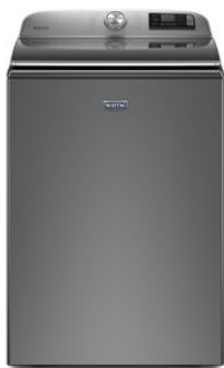
ALSO AVAILABLE / STEP UP MVW7230H

Be sure to tune into your customers' shopping priorities to bundle products across categories