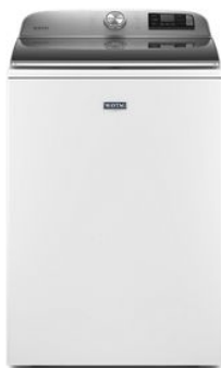
ALSO AVAILABLE / STEP UP MVW7230H

Be sure to tune into your customers' shopping priorities to bundle products across categories