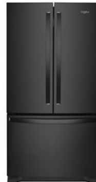
SUITE MATCH REFRIGERATOR WRF535SMH