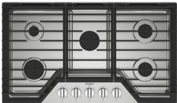
ALSO AVAILABLE / STEP UP WCGK5036P

Be sure to tune into your customers' shopping priorities to bundle products across categories