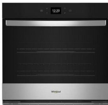
SUITE MATCH COOKING RANGE / WALL OVEN WOES5030L