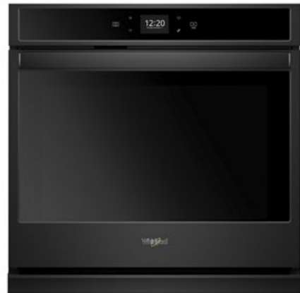
SUITE MATCH COOKING RANGE / WALL OVEN WOS51EC0H