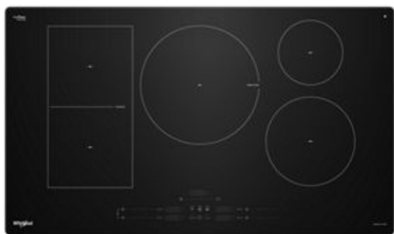
ALSO AVAILABLE / STEP UP WCIT7536S

Be sure to tune into your customers' shopping priorities to bundle products across categories