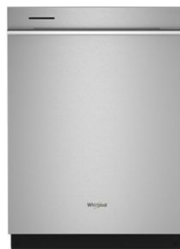
SUITE MATCH DISHWASHER WDTA80SAK