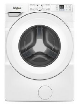
LAUNDRY / PAIR WITH WFW4720R