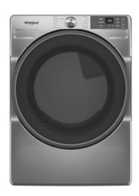
ALSO AVAILABLE / STEP UP WED5720R

Be sure to tune into your customers' shopping priorities to bundle products across categories