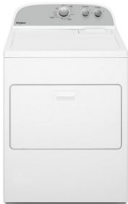
ALSO AVAILABLE / STEP UP WED4950H

Be sure to tune into your customers' shipping priorities to bundle products across categories