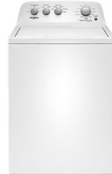
LAUNDRY / PAIR WITH WTW4850H