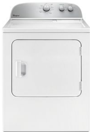
ALSO AVAILABLE / STEP UP WED4985E

Be sure to tune into your customers' shipping priorities to bundle products across categories