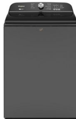
LAUNDRY / PAIR WITH WTW6157P