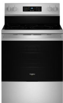
ALSO AVAILABLE / STEP UP WFES5030R

Be sure to tune into your customers' shopping priorities to bundle products across categories