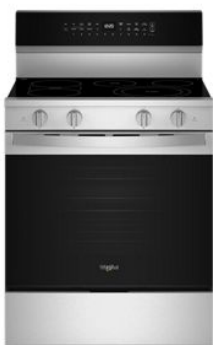
ALSO AVAILABLE / STEP UP WFES7530R

Be sure to tune into your customers' shopping priorities to bundle products across categories