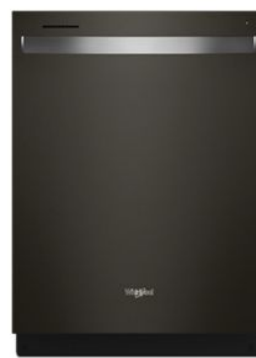
SUITE MATCH DISHWASHER WDT970SAK