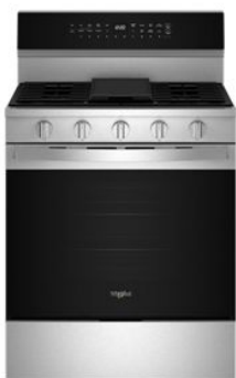
ALSO AVAILABLE / STEP UP WFGS7530R

Be sure to tune into your customers' shopping priorities to bundle products across categories