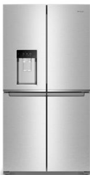
SUITE MATCH REFRIGERATOR WRQC7836R