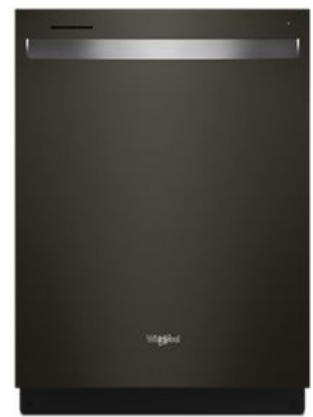
SUITE MATCH DISHWASHER WDT970SAK