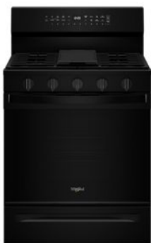
ALSO AVAILABLE / STEP UP WFGS7530R

Be sure to tune into your customers' shopping priorities to bundle products across categories