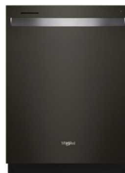
SUITE MATCH DISHWASHER WDT970SAK