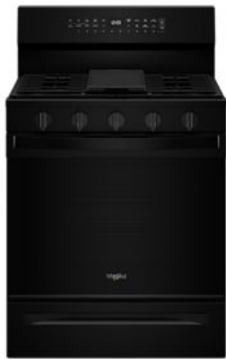
ALSO AVAILABLE / STEP UP WFGS7530R

Be sure to tune into your customers' shopping priorities to bundle products across categories