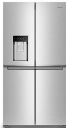
SUITE MATCH REFRIGERATOR WRQC7836R