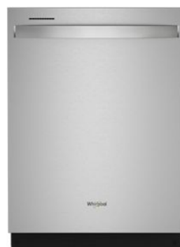
SUITE MATCH DISHWASHER WDT970SAK