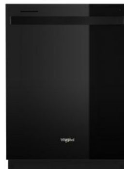
SUITE MATCH DISHWASHER WDT750SAK