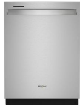
SUITE MATCH DISHWASHER WDT750SAK