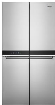
SUITE MATCH REFRIGERATOR WRQA59CNK