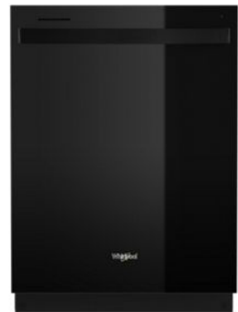
SUITE MATCH DISHWASHER WDT750SAK