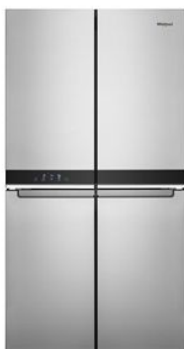
SUITE MATCH REFRIGERATOR WRQA59CNK