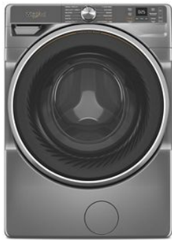
ALSO AVAILABLE / STEP UP WFW6720R

Be sure to tune into your customers' shopping priorities to bundle products across categories