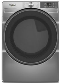
LAUNDRY / PAIR WITH WED5720R