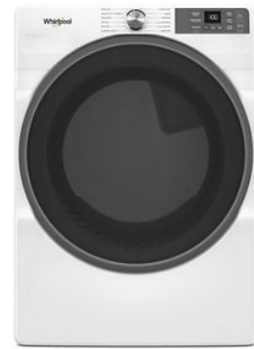
LAUNDRY / PAIR WITH (GAS) WGD5720R