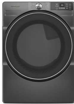
LAUNDRY / PAIR WITH WED5720R