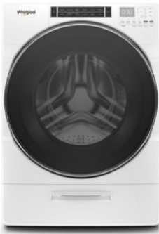
ALSO AVAILABLE / STEP UP WFW8620H

Be sure to tune into your customers' shopping priorities to bundle products across categories