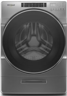
ALSO AVAILABLE / STEP UP WFW8620H

Be sure to tune into your customers' shopping priorities to bundle products across categories