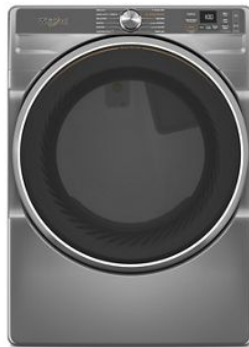
LAUNDRY / PAIR WITH WED6720R