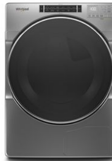
LAUNDRY / PAIR WITH WHD862CH