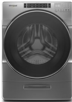
ALSO AVAILABLE / STEP UP WFW8620H

Be sure to tune into your customers' shopping priorities to bundle products across categories