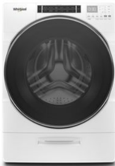
ALSO AVAILABLE / STEP UP WFW8620H

Be sure to tune into your customers' shopping priorities to bundle products across categories