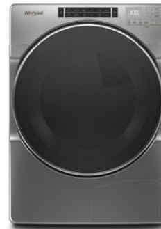
LAUNDRY / PAIR WITH WHD862CH