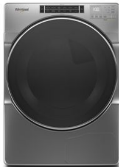
ALSO AVAILABLE / STEP UP WHD862CH

Be sure to tune into your customers' shopping priorities to bundle products across categories