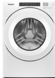
LAUNDRY / PAIR WITH WFW560CH