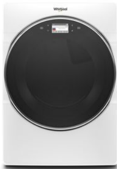
ALSO AVAILABLE / STEP UP WGD9620H

Be sure to tune into your customers' shopping priorities to bundle products across categories