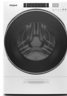
LAUNDRY / PAIR WITH WFW8620H