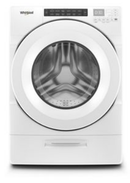
LAUNDRY / PAIR WITH WFW5620H