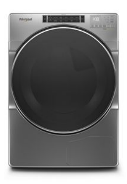
ALSO AVAILABLE / STEP UP WHD862CH

Be sure to tune into your customers' shopping priorities to bundle products across categories