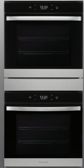
Available in Double Oven WOD52ES4M Z/B/W 5.8 Cu. Ft.

Price per square foot is increasing, and customers still expect key features in an oven while fitting into a smaller foot print.