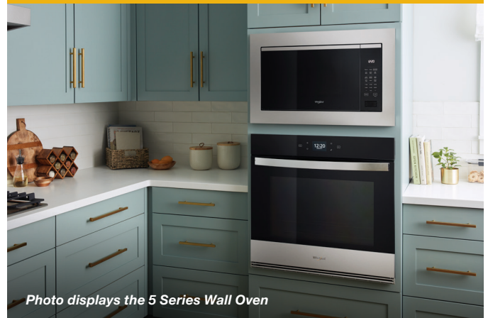
Photo displays the 5 Series Wall Oven

Add a microwave installed in a cabinet with a trim kit to make the appliance look built in.