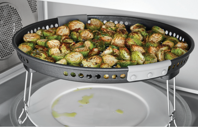
AIR FRY MODE