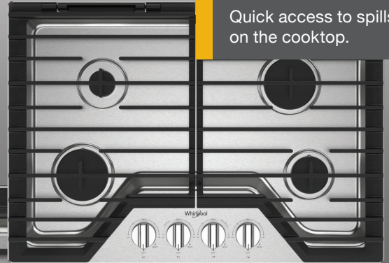
WCGK5030/36PW/B/S/V Gas Cooktop