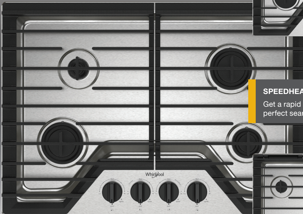
WCGK3030PW/B/S 30" Gas Cooktop

Get a rapid boil and perfect sear quickly.