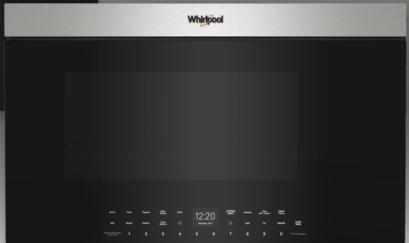
WMMF7530R Z/V 1.1 Cu. Ft. Over-the-Range Built-In Microwave

Easily melt ingredients like chocolate, butter and more. (Exclusively on the WMMF7530R)