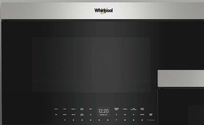
WMMF7330R W/B/Z/V 1.1 Cu. Ft. Over-the-Range Built-In Microwave

Get crispy results without countertop clutter.