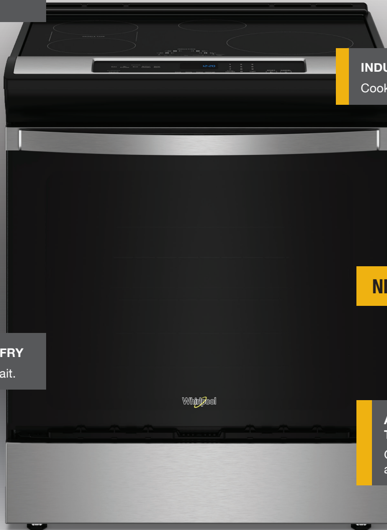
WSIS5030R Z/V 6.4 Cu. Ft. Induction Slide-In Range