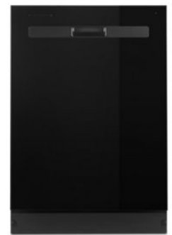
SUITE MATCH DISHWASHER WDP560HAM