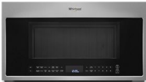
ALSO AVAILABLE / STEP UP WMH78519L

Be sure to tune into your customers' shopping priorities to bundle products across categories