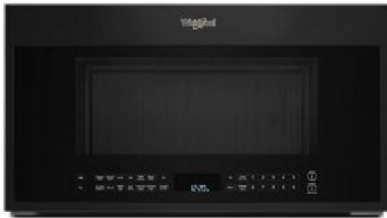
ALSO AVAILABLE / STEP UP WMH78519L

Be sure to tune into your customers' shopping priorities to bundle products across categories