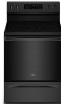
SUITE MATCH COOKING RANGE / WALL OVEN WFE550S0L