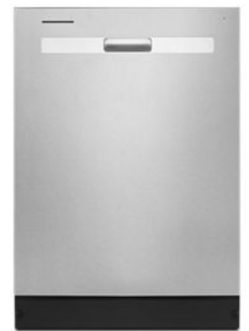
SUITE MATCH DISHWASHER WDP560HAM