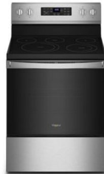
SUITE MATCH COOKING RANGE / WALL OVEN WFE550S0L