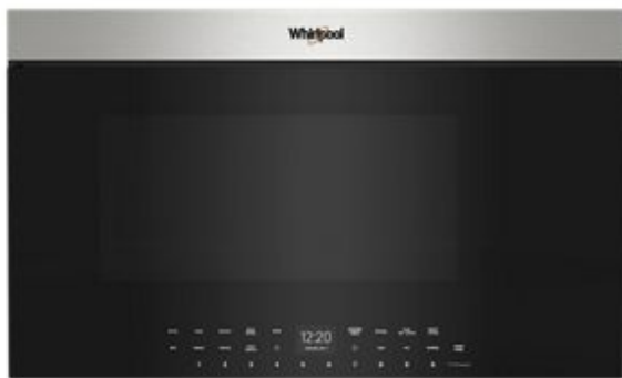
ALSO AVAILABLE / STEP UP WMMF7330R

Be sure to tune into your customers' shopping priorities to bundle products across categories