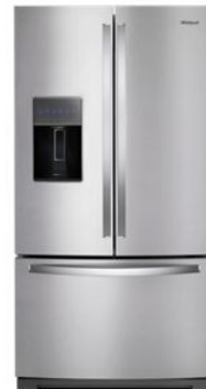
SUITE MATCH REFRIGERATOR WRF767SDH