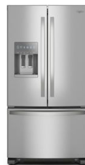
SUITE MATCH REFRIGERATOR WRFF3436R