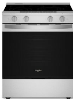
SUITE MATCH COOKING RANGE / WALL OVEN WSES7530R