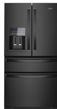
SUITE MATCH REFRIGERATOR WRMF3636R