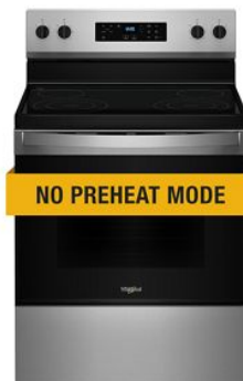
SUITE MATCH COOKING RANGE / WALL OVEN WFES3530R