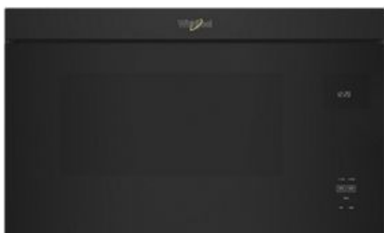
ALSO AVAILABLE / STEP UP WMMF5930P

Be sure to tune into your customers' shopping priorities to bundle products across categories