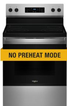
SUITE MATCH COOKING RANGE / WALL OVEN WFES3530R