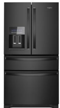
SUITE MATCH REFRIGERATOR WRMF3636R