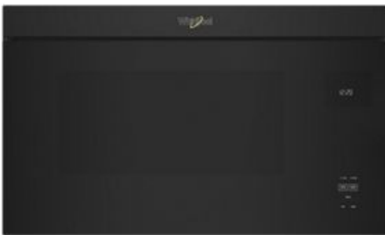
ALSO AVAILABLE / STEP UP WMMF5930P

Be sure to tune into your customers' shopping priorities to bundle products across categories