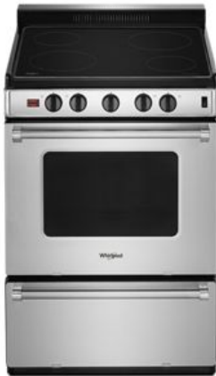
SUITE MATCH COOKING RANGE / WALL OVEN WFE500M4

Be sure to tune into your customers' shipping priorities to bundle products across categories