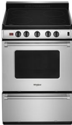
SUITE MATCH COOKING RANGE / WALL OVEN WFE500M4

Be sure to tune into your customers' shopping priorities to bundle products across categories