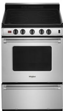
SUITE MATCH COOKING RANGE / WALL OVEN WFE500M4

Be sure to tune into your customers' shopping priorities to bundle products across categories