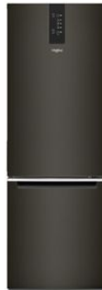
SUITE MATCH REFRIGERATOR WRB543CMJ