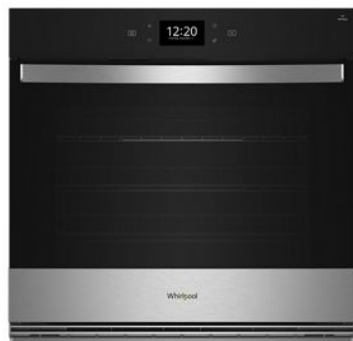
ALSO AVAILABLE / STEP UP WOES7027P

Be sure to tune into your customers' shopping priorities to bundle products across categories