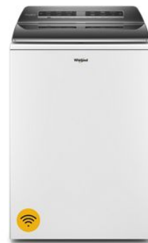
LAUNDRY / PAIR WITH WTW8127L